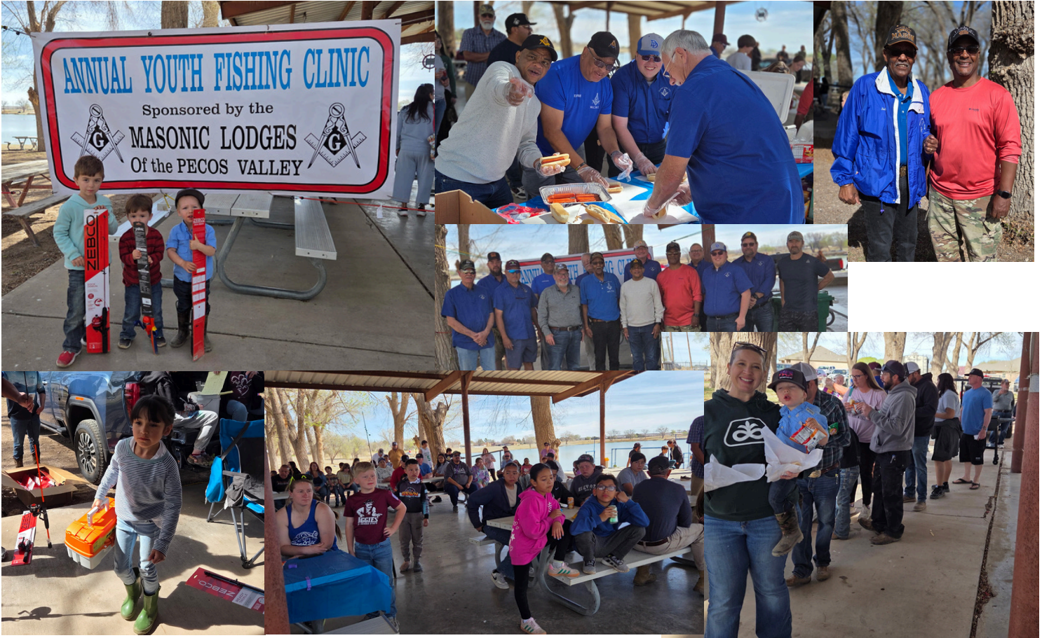
The Masons of the Pecos Valley were busy in March. They hosted the annual fishing clinic at Lake Van and then went to cook steaks as a fundraiser for the Eddy County Youth supporters. .