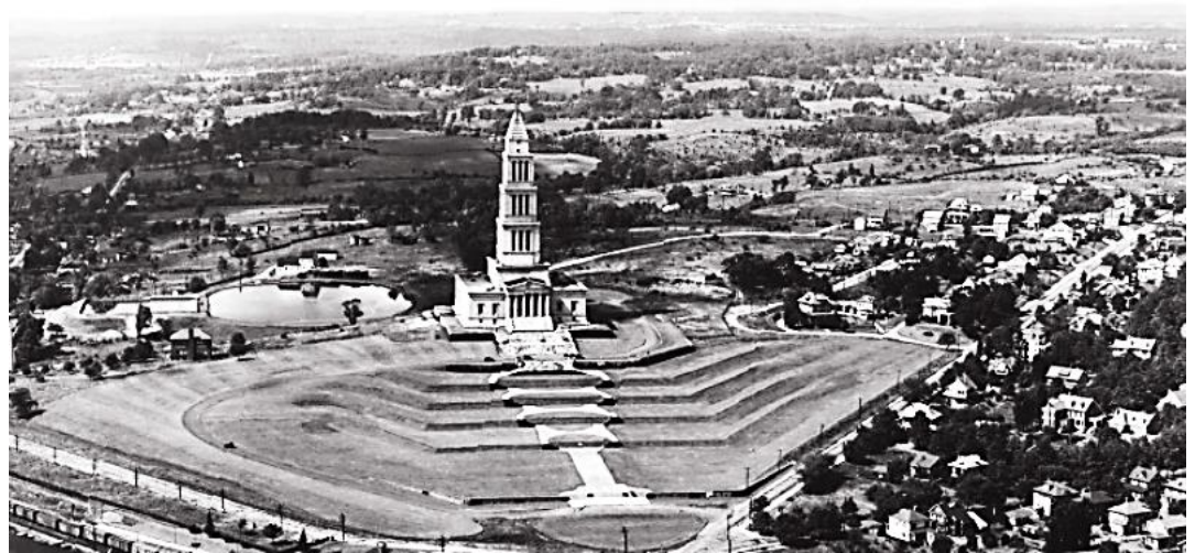
Figure 1: The George Washington Masonic National Memorial